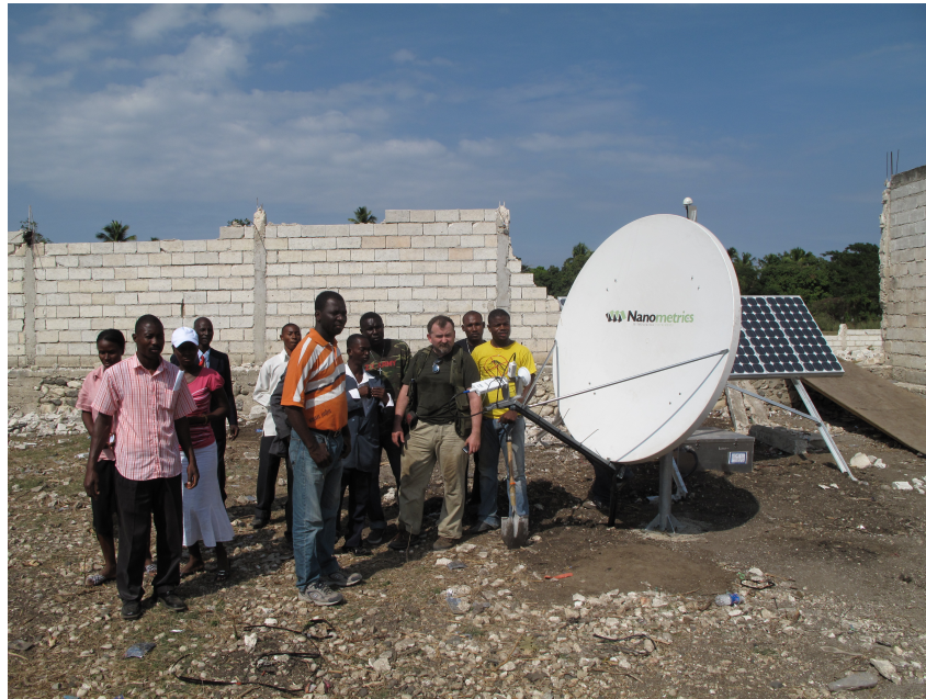
Figure 8.3: The station installed in Léogâne by the Geological Survey of Canada.

instruments in Port-au-Prince, Jacmel and Leogâne (Figure 8.3). Aftershocks were located by GSC seismologists and the phase data and solutions were forwarded to the International Seismological Centre and other international organizations on a daily basis during the months immediately following the earthquake. The data are forwarded in real time to IRIS and the Caribbean Tsunami Warning Centre. The stations continue to operate but their reliability has somewhat decreased with time primarily due to problems with the power supply and security. Further information about the Canadian deployment may be found at http://www.earthquakescanada.nrcan.gc.ca/haiti/index-eng.php .